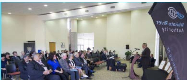
Five Year Report launch at Waikato-Tainui College, Hopuhopu.