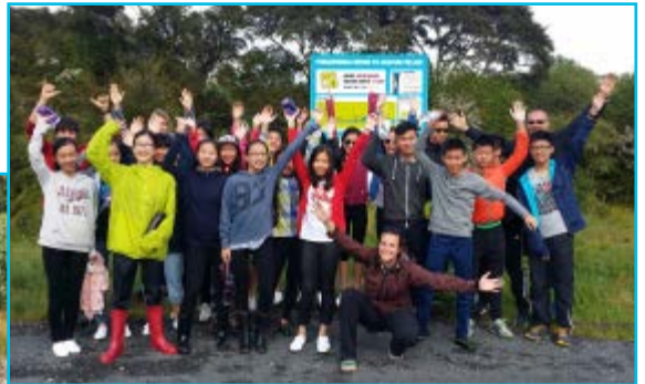
Students from Hong Kong's Victoria Shanghai Academy who carried out volunteer work on the Waikato River Trails recently.

The Waikato River Trails project between Atiamuri and Lake Karapiro has been a key beneficiary of funding from the Waikato River Authority in recent years. The river trails project has enabled significant riparian management with 42,000 native trees being planted. The project continues to provide river access for many thousands of people every year and involve a large range of volunteer and community groups in trail maintenance.