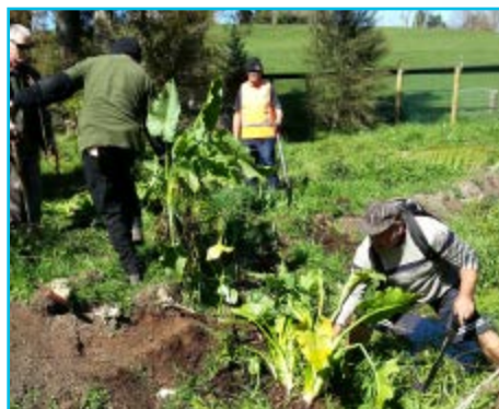
Volunteers from Wintec clear pest plants from the Rotopiko peat lake reserve.

Volunteers including locals, Dairy NZ, Wintec, Mangaiti Gully Group, Tamahere Community Nursery, and Te Awamutu Intermediate School, have contributed over 1000 hours of time towards the project. They have planted almost 3000 native plants from 62 species at the site, and undertaken regular weed management.