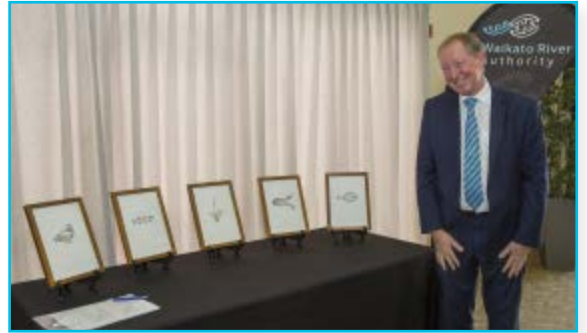
Minister for the Environment Hon Dr Nick Smith with a set of limited edition prints commemorating the fifth anniversary of the Authority.